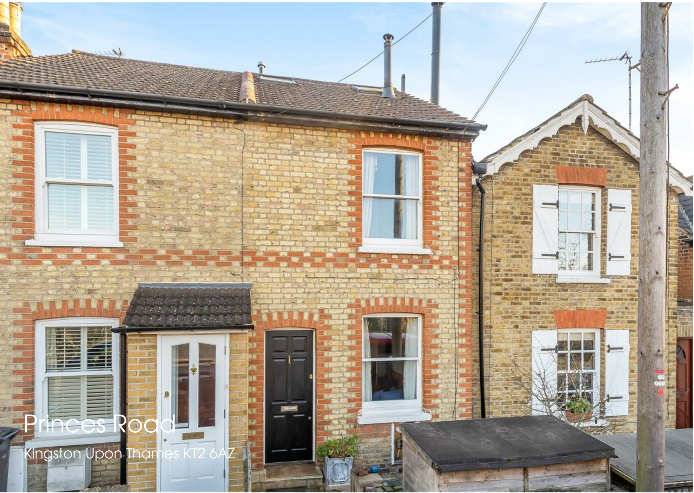
Princes Road Kingston Upon Thames KT2 6AZ